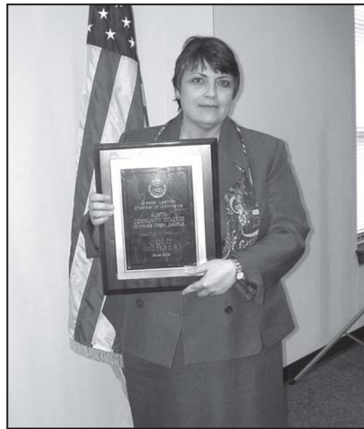
Austin Community College, Gold Member