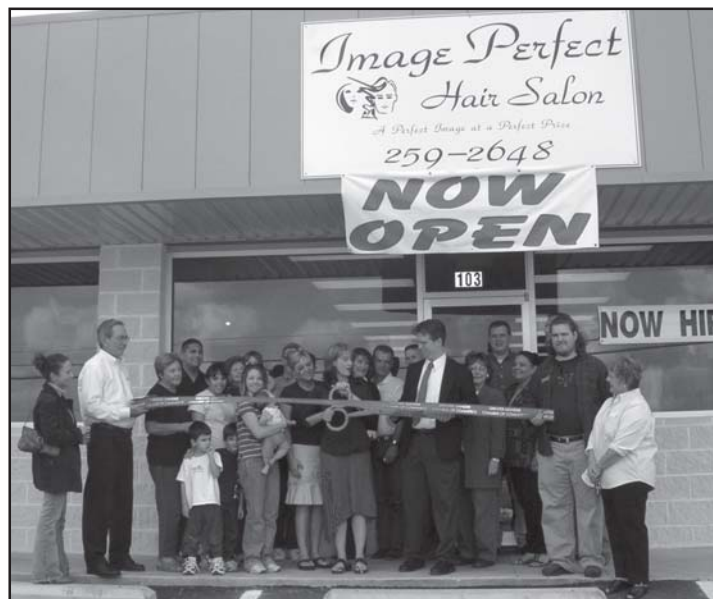
Image Perfect Hair Salon, located at 24035 HWY 183 Ste 103 - Leander, TX 78641, held its ribbon cutting Nov. 10, 2004. The shop's phone number is (512) 259-2648.

Greater Leander Chamber of Commerce 301 S. West Drive P.O. Box 556 Leander, TX 78646 (512) 259-1907 www.leandercc.org