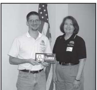
Broad Insurance Financial Service, Bronze Member