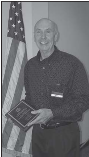
Hill Country Community Ministries, Silver Member