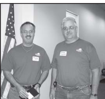
Car Pool Car Wash, Bronze Member