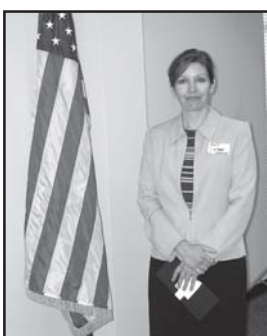
I of Texas Insurance, Bronze Member