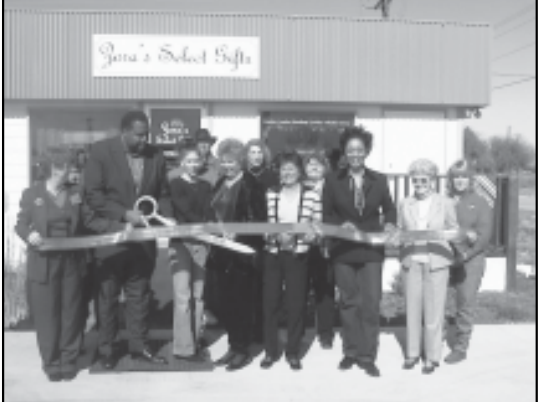
Zora's Select Gifts held its cutting Dec. 5, 2003, at the shop, located on CR 269. Zora's sells gifts of all kinds, ranging from candles to figurines, clocks and greeting cards.