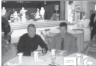
Left and below left: Chamber and community members enjoyed the chamber banquet, held at Leander Middle School in October 2003.